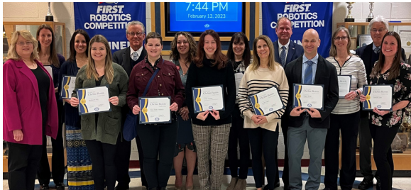
Recipients of Chelsie Bemis Teacher Grants with UCS Foundation representatives

The UCS Foundation is proud to annually dedicate funds for the Chelsie Bemis Teacher Grant Program, designed to enhance student learning through a real-world experience consistent with UCS curricular goals.