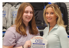
Top right: Eisenhower Store Lower Right: Stevenson Store

The Eagles Nest, of Eisenhower High School, The Talon, of Henry Ford II High School, The Titan Shoppe, of Stevenson High School, and The Chief Connection, of Utica High School have Gold Level Certification for the 2022-2023 school year and will be recognized during DECA's International Career Development Conference in Orlando, Florida.